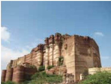
Mehrangarh Fort, Jodhpur