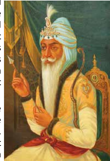
Maharaja Ranjit Singh

The Sikh territories in the late eighteenth century extended from the Indus to the Jamuna but they were divided under different rulers. The misls cooperated with one another but failed to unite as a single power. It was only under Maharaja Ranjit Singh (of the Sukerchakia misl ) that they united as a Sikh kingdom. He established his capital at Lahore in 1799.