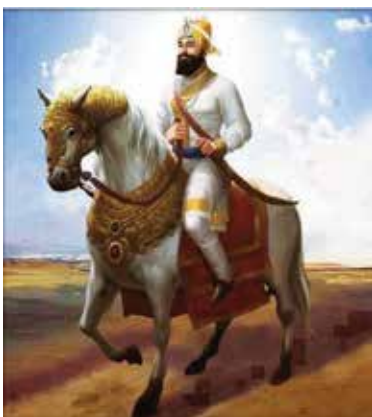
Guru Gobind Singh

Rajput kings of Amber, Jodhpur and others had served the Mughals with loyalty. Therefore, the emperors had allowed them considerable independence in ruling over their watan jagirs . Sawai Raja Jai Singh of Amber was governor of Malwa and Raja Ajit Singh governor of Gujarat. In 1713, Emperor Jahandar Shah renewed these offices. Sawai Raja Jai Singh was given the subadari of Agra in 1722. Both of them extended their territories by seizing portions of imperial territories neighbouring their watans (homelands). Jodhpur state conquered and annexed Nagaur and Amber state seized large portions of Bundi. Sawai Raja Jai Singh also founded his new capital Jaipur. But from the 1740s further expansion of these states was checked by Maratha campaigns into Rajasthan.