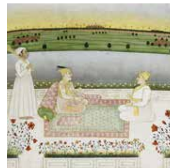
Alivardi Khan holding court

Murshid Quli Khan shifted his capital to Murshidabad. He was succeeded by Shujauddin Khan and Alivardi Khan (1740-1756).