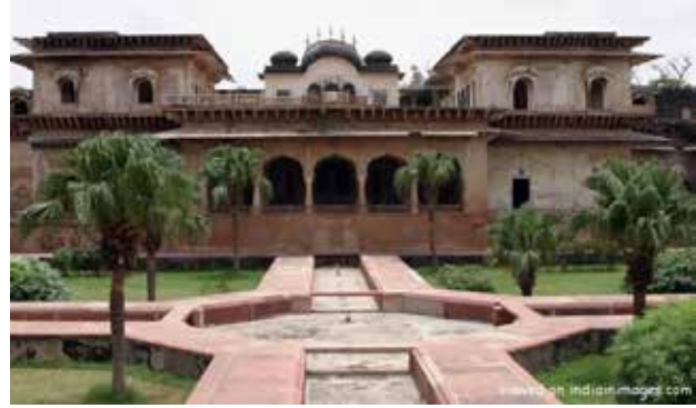
Garden palace at Dig, district Bharatpur, Rajasthan

The Jats were the peasants of the fertile land on both sides of the Yamuna. During the rule of early Mughals, the land revenue was one-third of the produce. It was gradually increased to almost half during the Aurangzeb's rule. It angered the Jats and revolt under the leadership of Gokul ensued in 1669. They were defeated but their struggle continued. The Jats consolidated their power during the later seventeenth and eighteenth centuries. Under their leader, Churaman, they acquired control over territories situated to the west of the city of Delhi. By the 1680s they had begun dominating the region between the two imperial cities of Delhi and Agra. The special feature of this movement was that the peasants fought along side the soldiers.