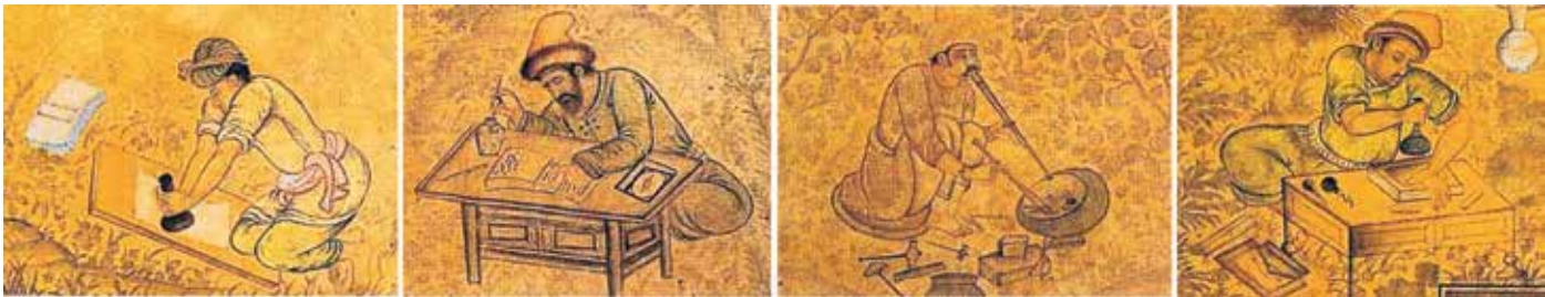
(a) Preparing the paper

Collection and Study of Manuscripts : The manuscripts were collected by wealthy people, rulers, monasteries and temples. There were no printing press in those days. So, scribes copied manuscripts by hand. These copies, and rarely the original manuscripts and documents were placed in libraries and archives. Archive is a place where manuscripts and documents are stored. Nowadays all national and state governments have archives where they keep all their old official records and transactions.