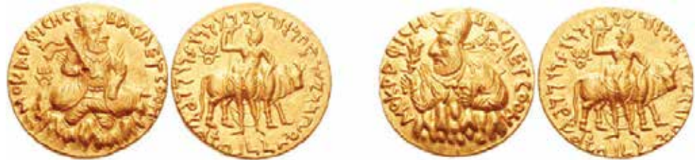
Coins of the medieval period

Historians depend on all types of sources for the study of medieval period also. They still rely on tools, coins, inscriptions, architecture and textual records (written on paper) for information. But the number and variety of textual records increased dramatically during this period. They slowly displaced other types of available information. Through this period paper gradually became cheaper and more widely available. So people used it to write chronicles of rulers, letters, petitions, judicial records and accounts. Chronicle is a series of historical events, written in the order in which they happened. They also wrote teachings of saints and holy texts on paper.