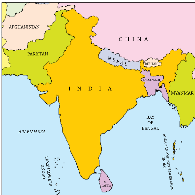
The Indian Subcontinent

describe the geography, the fauna and the culture of the inhabitants of the subcontinent.