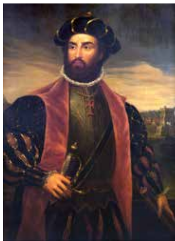
Vasco da Gama

The study of time is made somewhat easier by dividing the past into large time segments called periods that possess shared or common characteristics. Most historians look to economic, social and cultural factors to characterise the major elements of different moments of the past. It is not proper to divide the history only on the basis of the religion of rulers—Hindu, Muslim and British. You have read a wide range of early societies—hunter-gatherers, early farmers, people living in towns and villages and early kingdoms and empires in earlier class. Now you will read more about the spread of peasant societies, regional and imperial state formations, development of two major religions and the arrival of European trading companies.