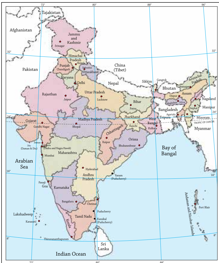
Political Map of India

This region consists of the Karakoram and Himalayas ranges. The Karakoram range extends beyond Pamir plateau in the north. It enters India in Kashmir and moves eastward into Tibet where it is known as the Kailas range. It includes the plateau of Aksaichin. It has very high mountains including Mount K2—Godwin Austin (8811 metres) which is the second highest peak in the world. It does not belong completely to Indian territory. The Baltoro and the Siachin are two important glaciers in this region. The western extensions of Himalayas—Ladakh and Zaskar ranges lie to the south of Karakoram range, on either side of river Indus which flows towards West.