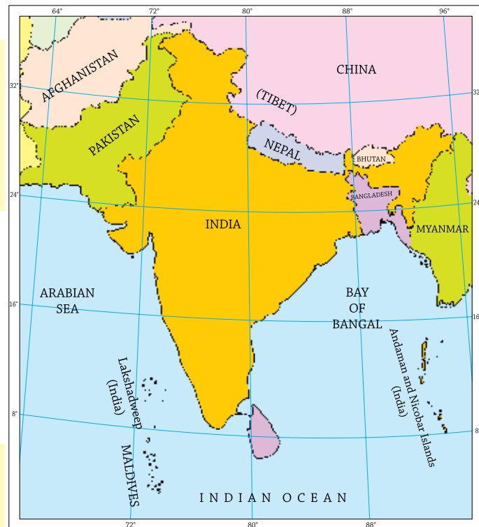
India and its neighbouring countries

India is one nation named as 'Republic of India' but for the sake of administration, it is divided into 28 States and 7 Union Territories.