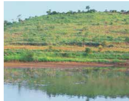
Watershed management (recharging of ground water) transforms barren land into a green meadow in just two years.

A Panchayat Samiti has many Gram Panchayats under it. Above the Panchayat Samiti, at the highest or district level, is the Zila (District) Panchayat or Zila Parishad . The Zila Parishad actually prepares plans for the development of the whole district, of which village is a part. With the help of the Panchayat Samitis, it regulates the money distribution among all the Gram Panchayats and implements programmes. It also makes the technical services available through B.D.O. (Block Development Officers) and other experts.