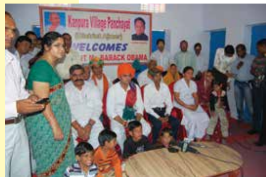
A Gram Sabha meeting

One member asked for a permanent solution which was a twofold programme of conserving water and recharging (refilling) the ground water in the rainy season. She told that more ground water was being drawn than was seeping into the ground. The government was also providing money for the recharging of ground water. The recharging includes planting of trees, constructing check dams and tanks. Everyone asked the Gram Panchayat to work on this guideline