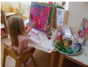
A child with special need painting on canvas