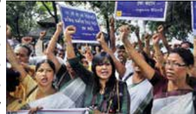
Women at a rally demanding their rights

Large groups of people : Dalits, women, tribals and peasants not only fought against the British but also fought against the inequalities they experienced in their lives. When India became a free nation, the Constitution of India was written. It was a document that laid out the rules by which the nation would function. Our leaders were aware of the ways in which discrimination had been practised in Indian society. They were concerned about the different kinds of inequalities that existed. So, these leaders set out a vision and goals in the Constitution that all the people of India were treated equally. The writers of the Constitution also said that respect for diversity was a significant element in ensuring equality. This equality of all persons is seen as a key value that unites us all as Indians. This is seen as an important element of our unity that we all live together and respect one another. But equality is a value that we have to keep striving for and not something which will happen automatically. People's struggles and positive actions by the government are necessary to make this a reality for all Indians.