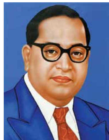
Dr. B.R. Ambedkar

The preamble of the Constitution of India