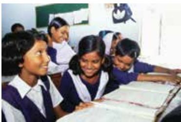
Girls studying in a rural school

People, at times, are unkind and even ruthless to create stereotypes about the 'disabled' children and tease them. Now the social service groups have changed the term 'disabled' and the new term used is 'children with special needs'. This is done to help them think positively and creatively instead of reminding them of their weakness by saying 'disabled' every time. But some prejudiced people think that the mind of these 'children with special needs' is weak and unbalanced as their limbs are weak, shaking and unable to keep balance. But they forget that the prominent scientist Stephen Hawking with many special needs is famous worldwide for his research and lectures in wheel chair.