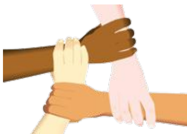
Unity in diversity