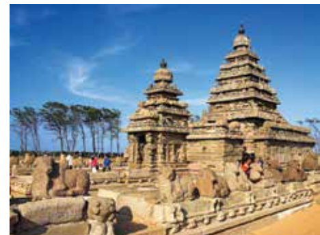
Monolithic temples at Mahabalipuram

out of a huge, single stone. These temples are called monoliths (mono= single, lith= stone). In carving out such temples the stone cutters had to work from top downwards with a careful planning.