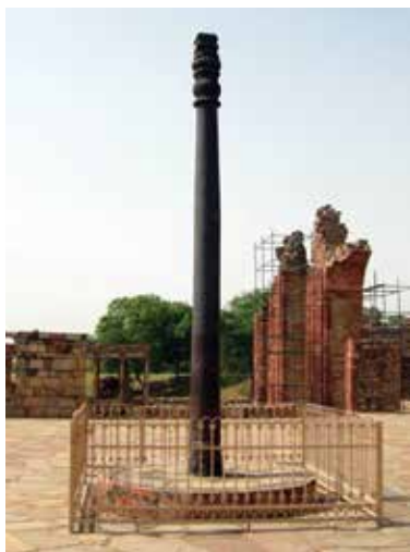
The Iron Pillar

The inscription on the Iron Pillar at Mehrauli, Delhi tells us that it was made about 1500 years ago by a ruler named Chandra. This ruler probably belonged to the Gupta dynasty. It is made of iron, 7.2 m high and weighs over 3 tonnes. It is most amazing that the iron of the pillar has not rusted even in 1500 years.