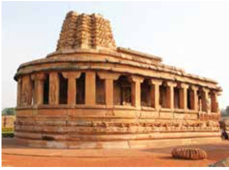
The Durga temple at Aihole

Then every piece was placed in precisely the right position. Several designs were carved out in every piece while stories or messages were carved out on the walls and ceilings.