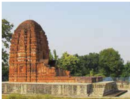
An early temple at Bhitargaon

An early temple at Bhitargaon, Uttar Pradesh was built about 1500 years ago. It was made of baked brick and stone. It also had a shikhar . Some of the finest stone temples were made in Mahabalipuram and Aihole (for location see). Each of the temples at Mahabalipuram was carved