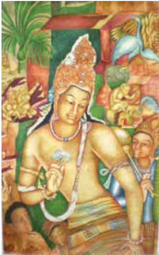
A painting from Ajanta

The Ajanta caves located in Maharashtra are artificial caves. These were hollowed out of the hills over hundreds of years. Buddhist monks lived in most of them. They meditated and taught there. So, these were monasteries. Some of these caves were decorated with paintings about the life of Buddha. Unknown artists created these world famous splendid works of art. They used the colours made of plants and minerals. It is amazing that the colours are bright even after 1500 years.