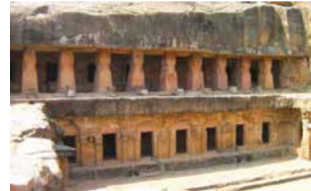
A Jain monastery from Orissa

Artificial Caves : Rocks were hollowed out to make artificial caves (for the monks and nuns and sometimes for the pilgrims and traders). Then, some caves were elaborately decorated with sculptures and painted walls. The two storey building was carved out of the rock surface. This was built for the Jain monks to live and meditate. The rooms are artificial caves. These regular shaped caves are very different from the natural caves like Bhimbetka (In present day Madhya Pradesh).