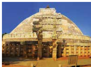
The Great Stupa at Sanchi

Stupa : The word stupa means a mound . Early stupas were made of earthen mound. Body remains (such as teeth, bone or ashes) of the Buddha or his follower monks or things they used along with precious stones and coins were put in a small box. This box is known as a relic casket . It was placed at the centre or heart of the stupa. This box was then covered with earth. Later, a layer of mud bricks or baked bricks was laid on the top to protect the stupa from rain. And then, this dome like structure was sometimes covered with carved stone slabs. This practice began during the time of Ashoka 2300 years ago. For many years an umbrella was also mounted on top of the stupa as a sign of honour.