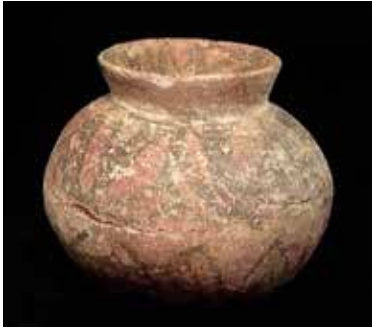
Jar to store grains

other plant produce. Some of the new tools were also made of animal bones while others had wooden handles. The new stone age demanded new ways and new means of living by the people. The steady food supply from agriculture had enabled them to achieve these changes over a comparatively short period. Therefore, it is called neolithic revolution. However, tools of the palaeolithic type continued to be made and used for bulky rough work.