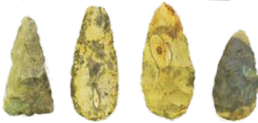
New stone tools (more pointed than of palaeolithic period)

other plant produce. Some of the new tools were also made of animal bones while others had wooden handles. The new stone age demanded new ways and new means of living by the people. The steady food supply from agriculture had enabled them to achieve these changes over a comparatively short period. Therefore, it is called neolithic revolution. However, tools of the palaeolithic type continued to be made and used for bulky rough work.