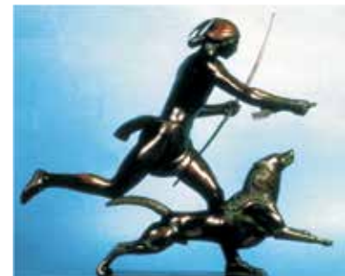
Taming the dog

Some animals like dogs ate the leftovers and were friendly to men, women and children. They played with these animals. These animals also followed them when they moved to another places. The first animal to be tamed was the wild ancestor of the dog. Later, people encouraged animals that were relatively gentle, to come near the camps where they lived. These animals such as sheep, goats, cattle and pigs lived and moved in large groups and most of them ate grass. People suckled their milk without being resisted. Often, people protected these animals from attacks by other wild animals like wolves. This is how early people became herders .