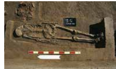
A burial from Mehrgarh (one human body)

In the Deccan, many burial sites were marked with huge blocks of stones called megaliths. These varied from a single standing stone to rock-cut chambers or a capstone balancing across upright stones