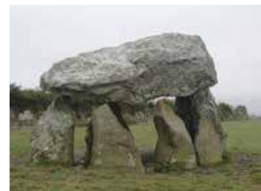
A Megalithic Burial Site