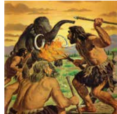
Early men using fire

About 12,000 years ago, there were major changes in the climate of the world. It became warmer. In many areas this led to the development of grasslands. Due to reduced precipitation forests cannot survive but grasses develop in moderate rainfall. This led to an increase in the population of grass eating animals like deer, antelope, goat, sheep and cattle. The hunter people followed these animals and learnt about their food habits, breeding season and timidity. They thought and learnt to herd and rear these animals themselves. At this time, grain bearing grasses like wheat, barley, and rice grew naturally in different parts of the subcontinent. As gatherers, people collected these grains as food. Gradually they learnt how and where they grew. So they got an idea to grow these plants on their own. After learning to grow agricultural crops, the early people also thought of growing other plants, especially fruits bearing plants. The human response to environmental changes led people to ripen fruits and store grains to meet the demands of difficult times.