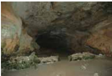
A natural cave

Archaeologists have found the sites where hunter-gatherers used to live. Many sites were located near sources of water, such as rivers and lakes. Habitation sites are places where early people lived. These include caves and rock shelters. People chose these natural caves because they provided shelter from the rain, heat and wind. Natural caves and shelters are found in the Vindhyas and the Deccan plateau. These rock shelters are close to the Narmada Valley. People chose to live here for the water from the river and forest produces nearby.