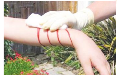
Cuts and Wounds