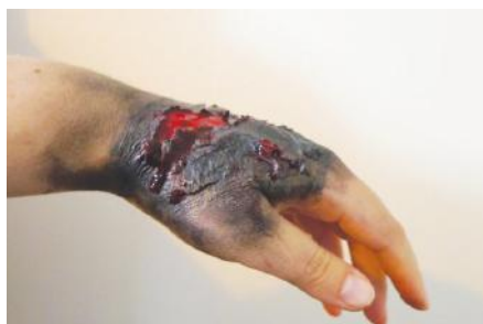
A burnt hand

First aid is the immediate medical assistance given to an injured person. It can save someone's life. Let us learn how to give first aid when someone gets injured.