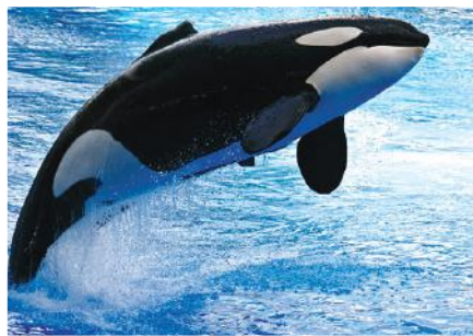
Whale is a lung breather