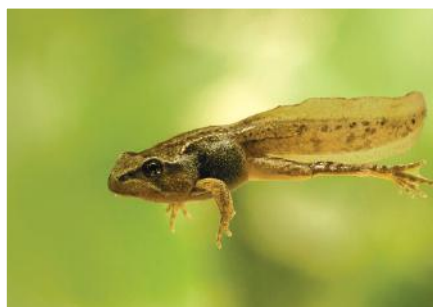
Tadpole in water