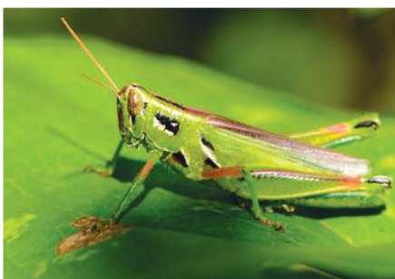
Spiracles and air-tubes for breathing