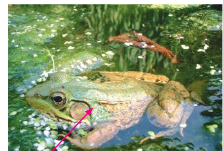
Frog in water