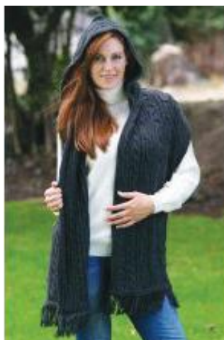
Woollen clothes in cold weather