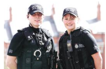
Policemen wear dress of tough materials