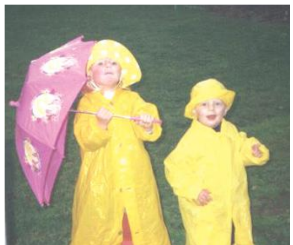
Raincoats in rainy season