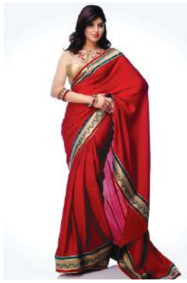
Indian woman wearing Saree

Many countries in the world consider some dresses as their national dresses. For example, saree is the national dress of women of India, while Kimono is the national dress of women of Japan. Hunfu is the national dress of women of China.