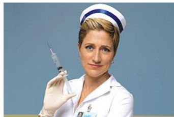
Nurse wears white dress