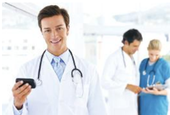
Doctors wear white coat

Therefore, we see that some clothes define the different professions of different people.