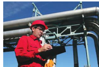
Factory worker wear overalls