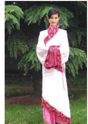
Chinese woman wearing Hunfu