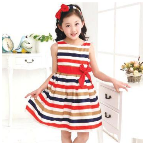
Cotton clothes in hot weather

During rainy season, raincoats made of waterproof material are used for protection from the rain.