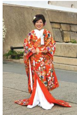
Japanese woman wearing Kimono