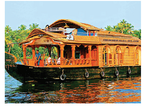
Houseboat on water