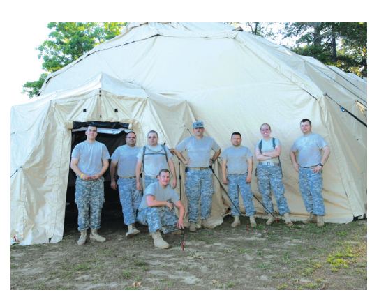
Soldiers using a tent