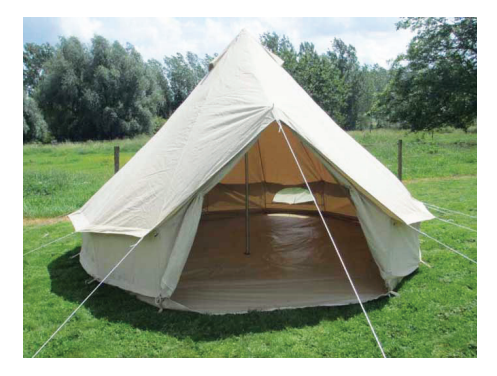
Tent-made of cloth