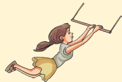
6. trapeze girl