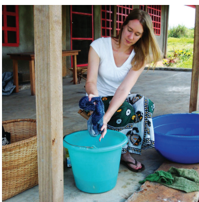
We use water for washing clothes .