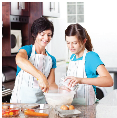
We use water for cooking .