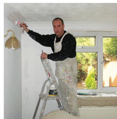
We use water while painting .