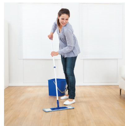
We use water for mopping .