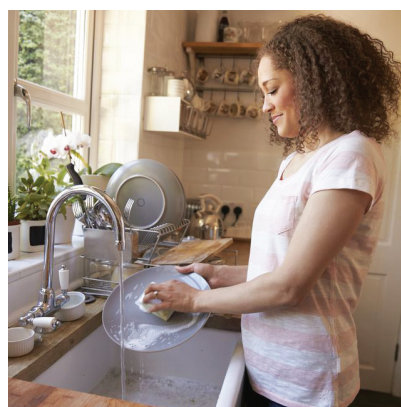
We use water for washing utensils .