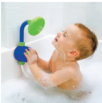
We use water for bathing .