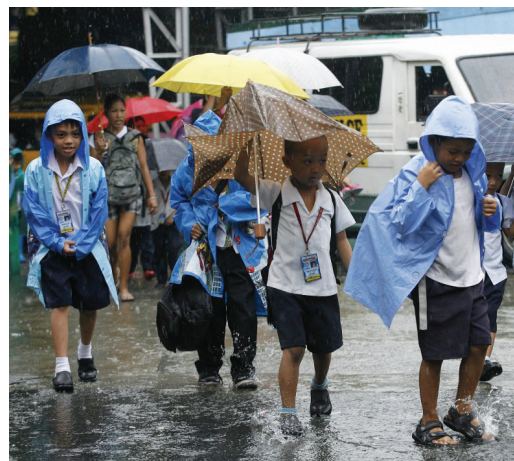
Children going to school in rainy season

In rainy season, we wear a raincoat when it rains. It prevents us from getting wet. We also wear gumboots and use umbrellas.