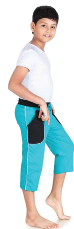
A boy in a short