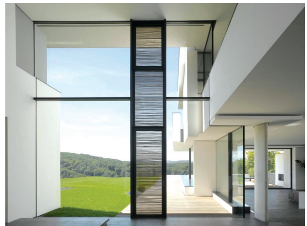
Ventilation in the house

We all live in our houses with our family. We should keep our house neat and tidy. There should be proper light and ventilation in the house.