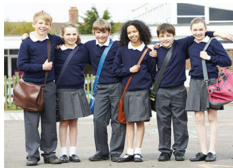
Children in school uniform

We should always make sure that our clothes are clean and tidy. We should take good care of our clothes.