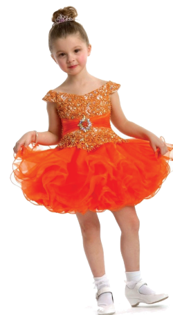
A girl in a frock