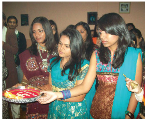
Traditional dresses for festivals

We also wear our clothes according to the occasions :