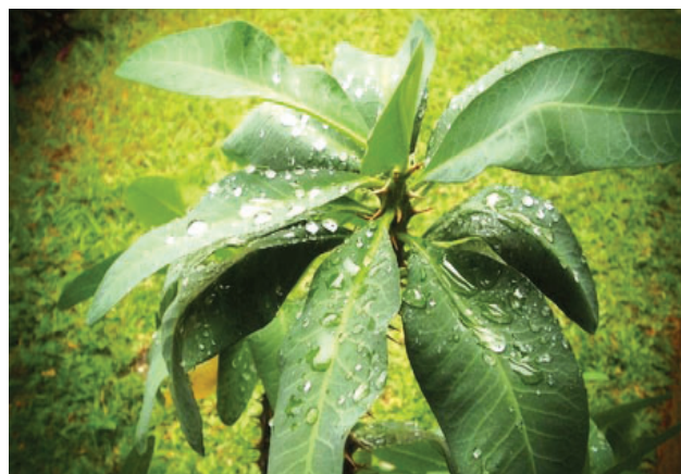
Plant in the water