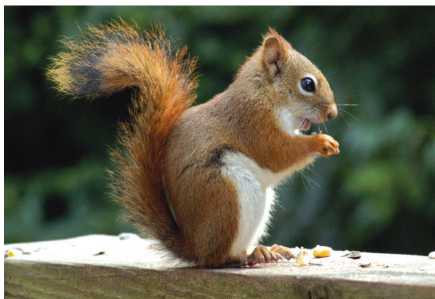
Squirrel eating food

Living things grow, breathe, feel, eat, move and reproduce. Plants, animals and human beings are living things .